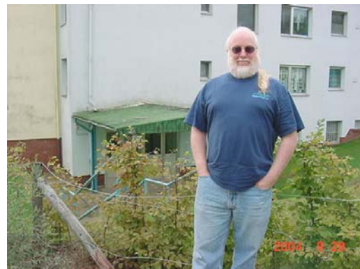
In front of the Trier Housing Teen Club.